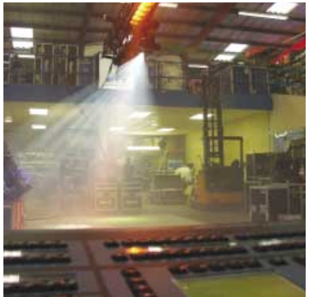
The Moving Light Company in demo mode.