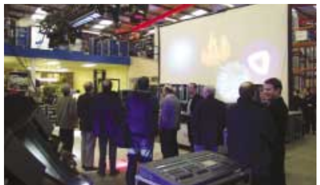
In the Moving Light workshop with MAC 2000 projection effects.