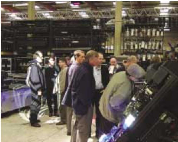
A tour group in the Moving Light Company area.