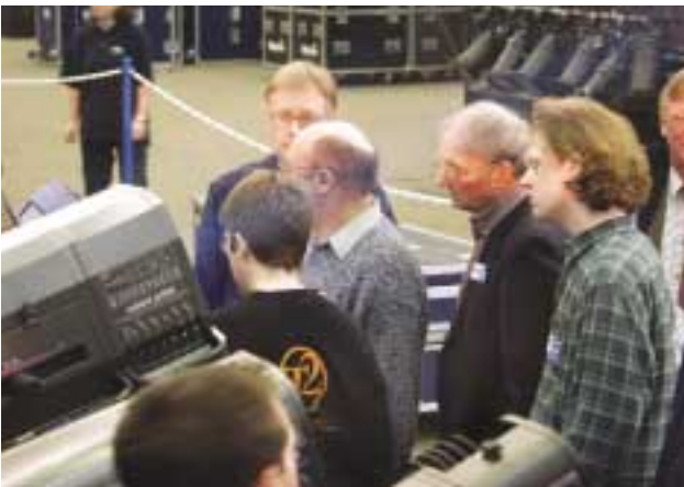
Time to play - visitors inspect Juliat followspots.