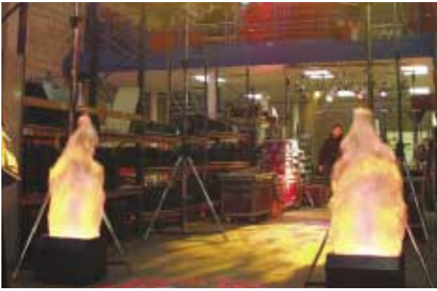
Flame projectors courtesy of Colourhouse.