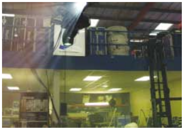
Another view of the Moving Light workshop area.