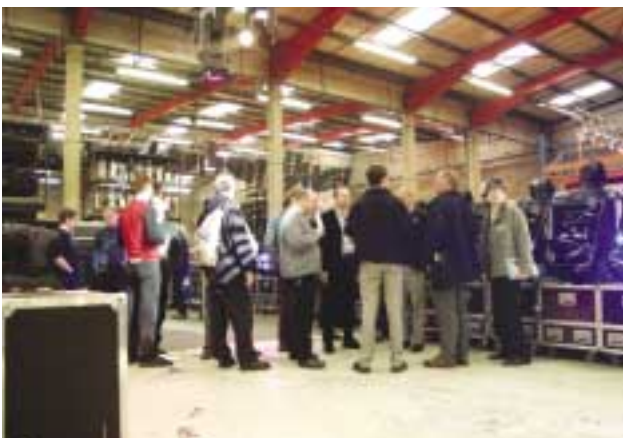
Visitors on tour. The new facility provides a total of 45,000 square feet of office and warehouse space.