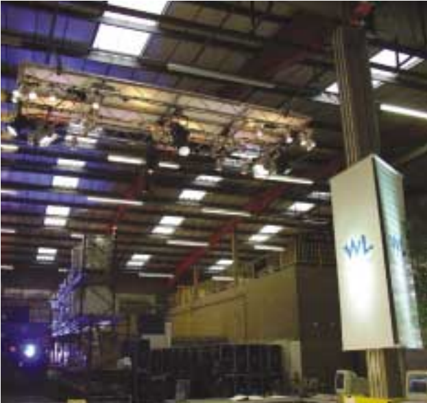
35,000 square feet of warehouse space has enabled all Group companies to come under one roof for the first time.