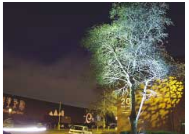
Outdoor effects courtesy Enliten.