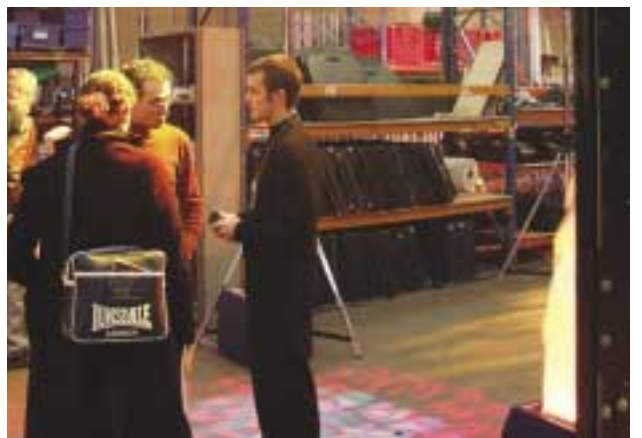
On-tour question time. Over 100 visitors attended the Open Day.