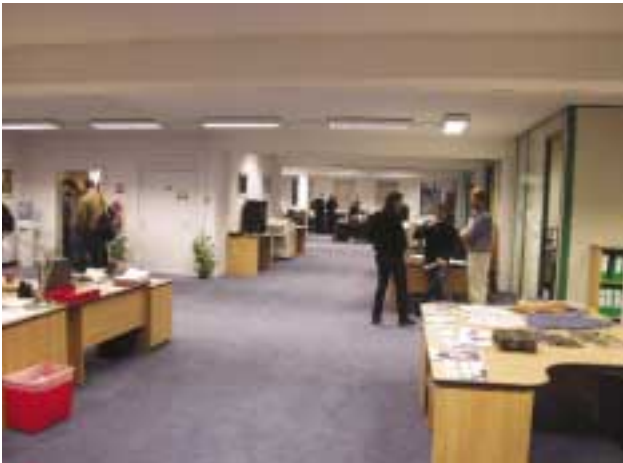
New office facilities provide room for future expansion