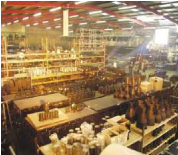
The lantern preparation area.