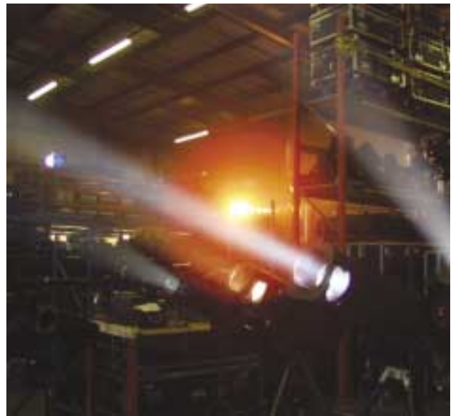
More Robert Juliat followspots in action.