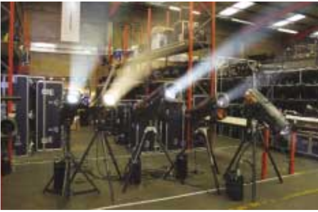
The full range of Robert Juliat followspots in demonstration.