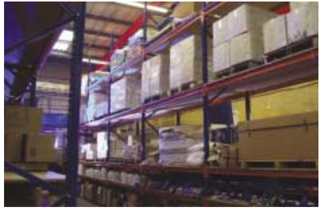
Part of the extensive stockholding area.