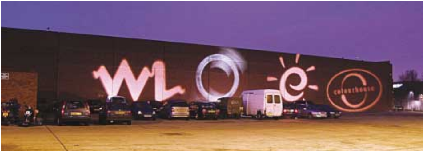
White Light's new facility provides easy truck access and ample parking.

Familiar faces from all aspects of the lighting industry discovered White Light's new base during a successful open day on 11th January. And they got to discover both how to get to White Light's new base in Wimbledon, London SW19, and how the facilities offered by the Group's new base are allowing the leading lighting hire and sales company to serve their customers with greater efficiency.